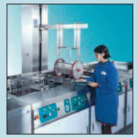
Optimum Console with Rigibot CTS-1000 Transport and RoTumbler Rotating Basket System.