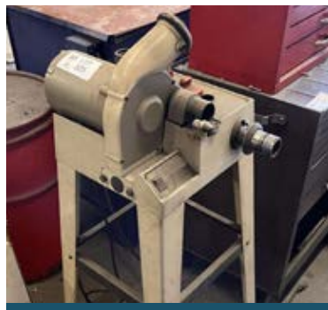
Darex SP2500 Drill Sharpener