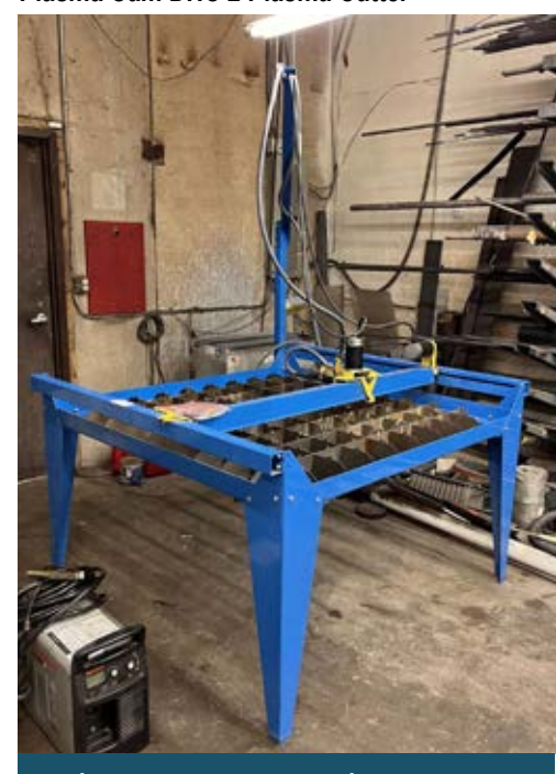
Plasma Cam DHC 2 Plasma Cutter