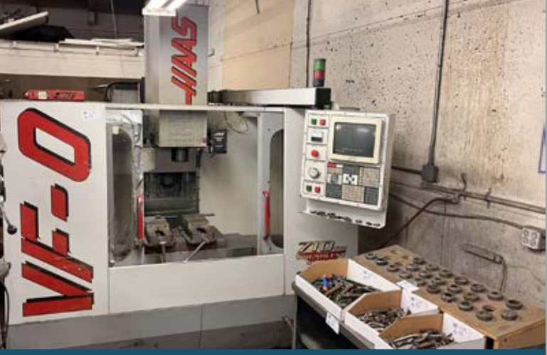
1996 Haas VFO CNC Vertical Machining Center

FEATURING: 2014 SMTCL 850E CNC Vertical Machining Center, 1996 Haas VFO CNC Vertical Machining Center, Hwacheon HIECO-10 CNC Turning Center, 2008 Haas SL-20T CNC Turning Center, Plasma Cutter, Hydmech H-230A Fully Automatic Horizontal Bandsaw, Tooling, Support Equipment and More!