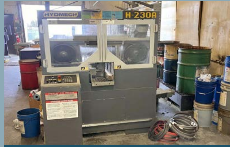
Hydmech H-230A Fully Automatic Horizontal Bandsaw