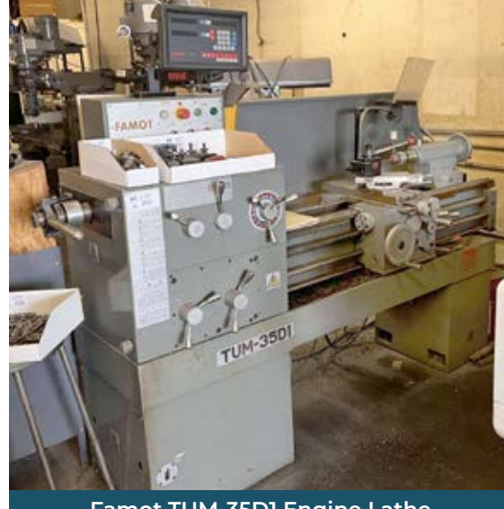
Famot TUM-35D1 Engine Lathe