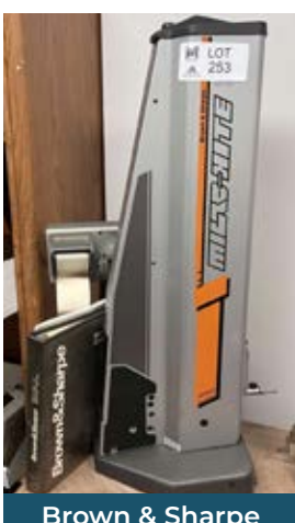
Brown & Sharpe Micro Hite Digital Height Gage