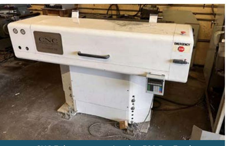
CNC Enhancements Autobar 300 Bar Feed