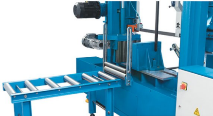
Solid feed roller table and material guide for workpiece bundles