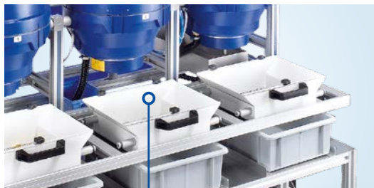
System for storing additional plastic containers for media