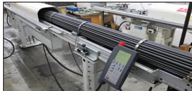
LNS EXPRESS 220 BARFEED

(2) 4'x6' downdraft tables; Olympic wire dispenser, with measuring unit; Assorted buffers, sanders and polishing grinders