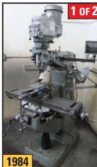
BRIDGEPORT SERIES I MILLING MACHINE