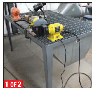
4'X6' DOWNDRAFT TABLE