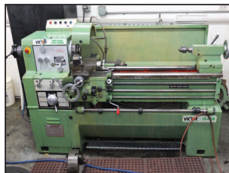
16" X 40" VICTOR 1640B ENGINE LATHE