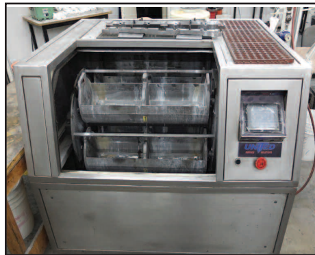
UNITED CPC-2500 CENTRIFUGAL BARREL FINISHING MACHINE