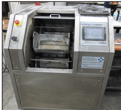
UNITED CPC-1000 CENTRIFUGAL BARREL FINISHING MACHINE