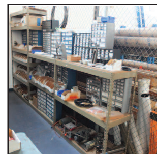
VIEW OF TOOLROOM

Do you have machinery for sale? Are you considering an auction?