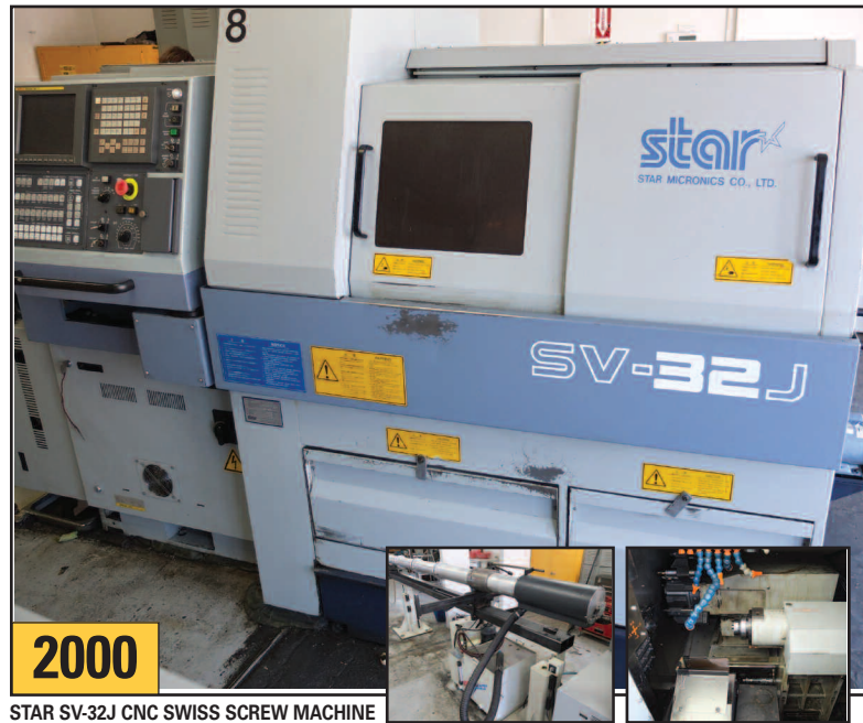
STAR SV-32J CNC SWISS SCREW MACHINE

(2) Escomatic N-M 647 CNC Coil-Fed , Fanuc 18IT controls, 6 axis, 1/4" (6.35 mm) cap, 12K rpm, 4ID, 3BW tools, cross drill, straightener, s/n 1704 & 2401, New 1999