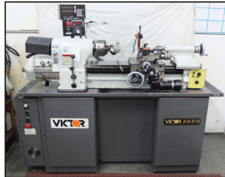
VICTOR 618 EVS PRECISION TOOLROOM LATHE