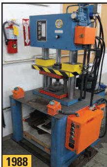
12 TON NEFF HYDRAULIC BENCH PRESS