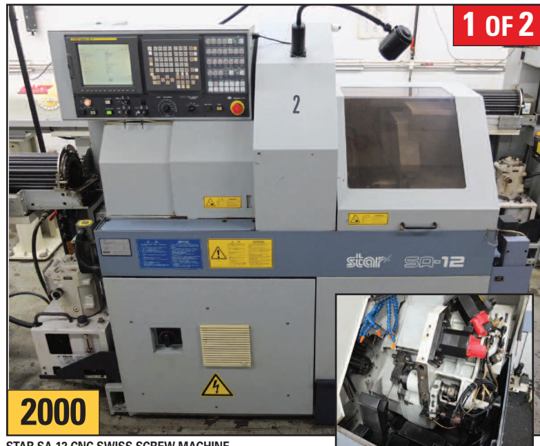
STAR SA-12 CNC SWISS SCREW MACHINE