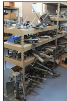
VIEW OF TOOLROOM