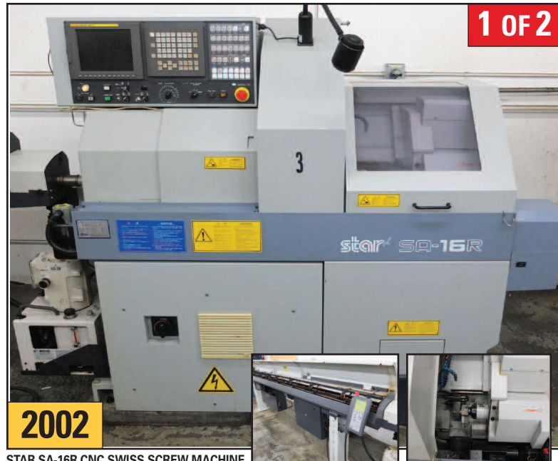
STAR SA-16R CNC SWISS SCREW MACHINE