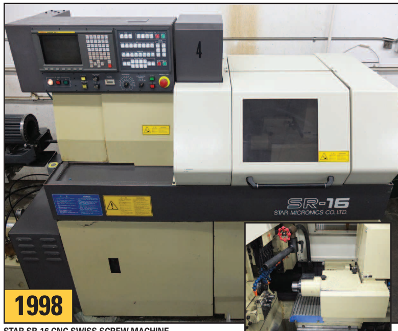
STAR SR-16 CNC SWISS SCREW MACHINE