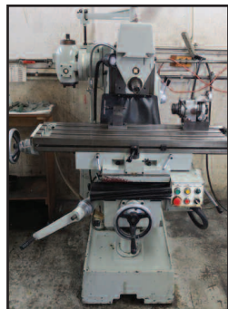
VICTOR UH-1 UNIVERSAL HORIZONTAL MILL