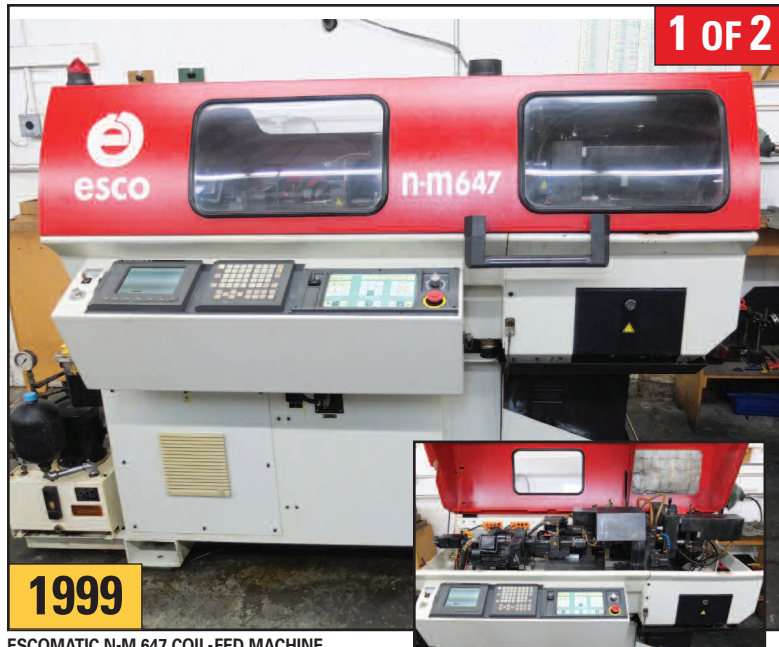
ESCOMATIC N-M 647 COIL-FED MACHINE