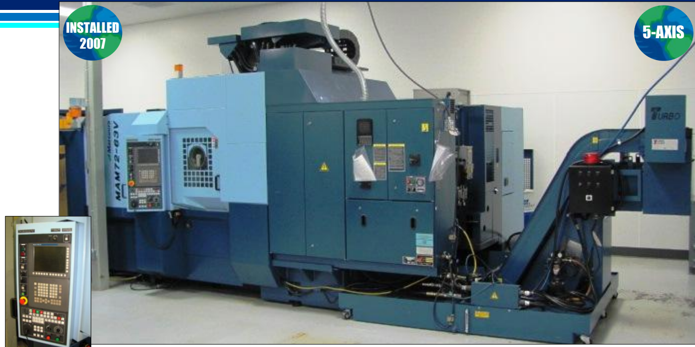
MATSUURA 5-AXIS CNC VMC MODEL MAM72-63V WITH (17) LINEAR PALLET POOL