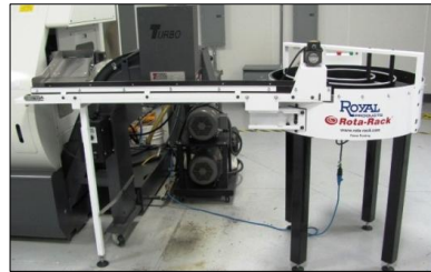
ROYAL PRODUCTS ROTA-RACK PARTS ACCUMULATOR