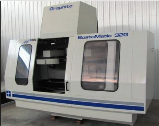
BOSTOMATIC VERTICAL MACHINING CENTER