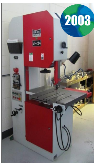
> DAKE JOHNSON MODEL VH-24, 24" VERTICAL BANDSAW