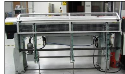
LNS QUICK SIX 6' AUTOMATIC BARFEED