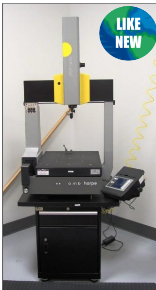
> BROWN & SHARPE COORDINATE MEASURING MACHINE MODEL 2000