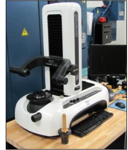
SPERONI TOOL PRESETTING AND MEASURING SYSTEM

Visit Our Website to See Upcoming Auctions & Join Our Mailing List