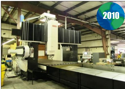
ATRUMP VERTICAL BRIDGE MILL

Asset Sales, Inc. – Colorado License Number 03-1143