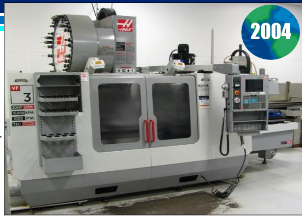
HAAS VERTICAL MACHINING CENTER MODEL VF-3B APC