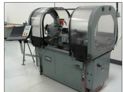
HARDINGE CNC LATHE

ROYAL Products Rota-Rack Parts Accumulator with Rota-Rack Conveyor, mfg.2007, sn:R1037