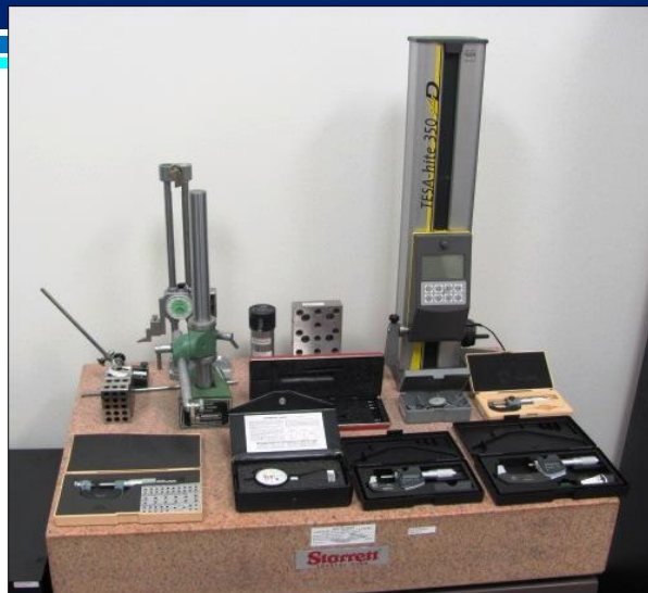
BROWN & SHARPE TESA-HITE 14" 350 DIGITAL HEIGHT GAGE