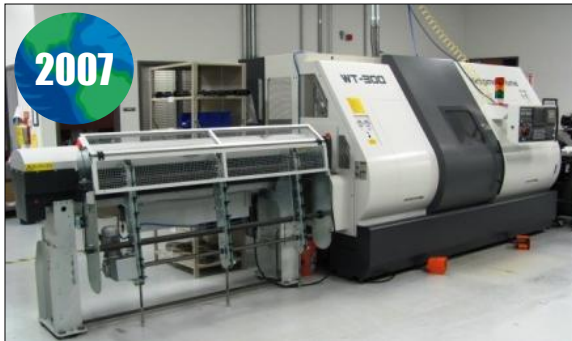
NAKAMURA TOME CNC TURNING CENTER MODEL WT-300MMY

Visit Our Website to See Upcoming Auctions & Join Our Mailing List