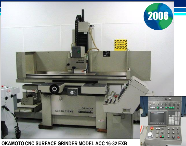
OKAMOTO CNC SURFACE GRINDER MODEL ACC 16-32 EXB