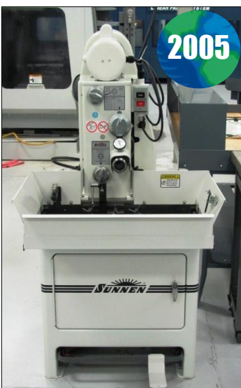
< SUNNEN HONING MACHINE MODEL MBB-1660