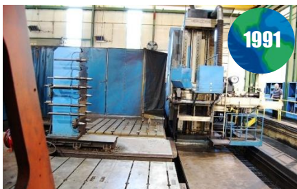
G & L 7' FLOOR TYPE CNC HBM X-488'; Y-118''