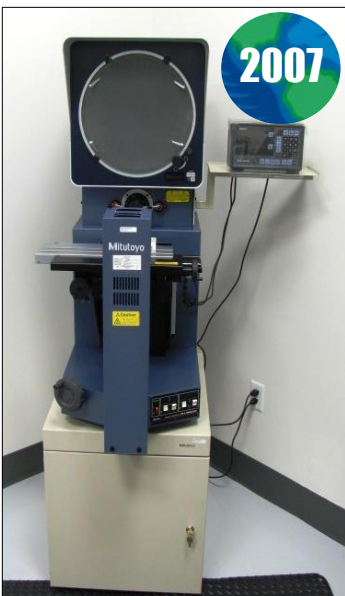
< MITUTOYO OPTICAL COMPARATOR MODEL PH-3500