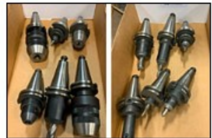
Assorted Cat-40 Holders & Tooling