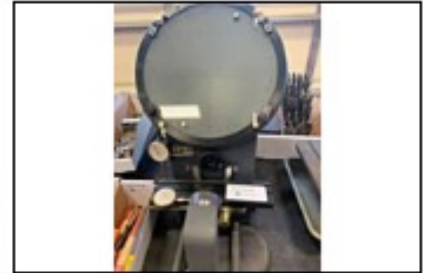
Micro-VU 500HP Optical Comparator