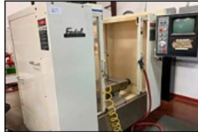
Fadal VMC 15 CNC Vertical Machining Center