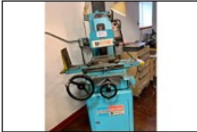
Boyar Schultz H612 Manual Surface Grinder