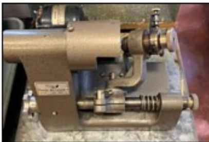
New Hermes Tool Grinder