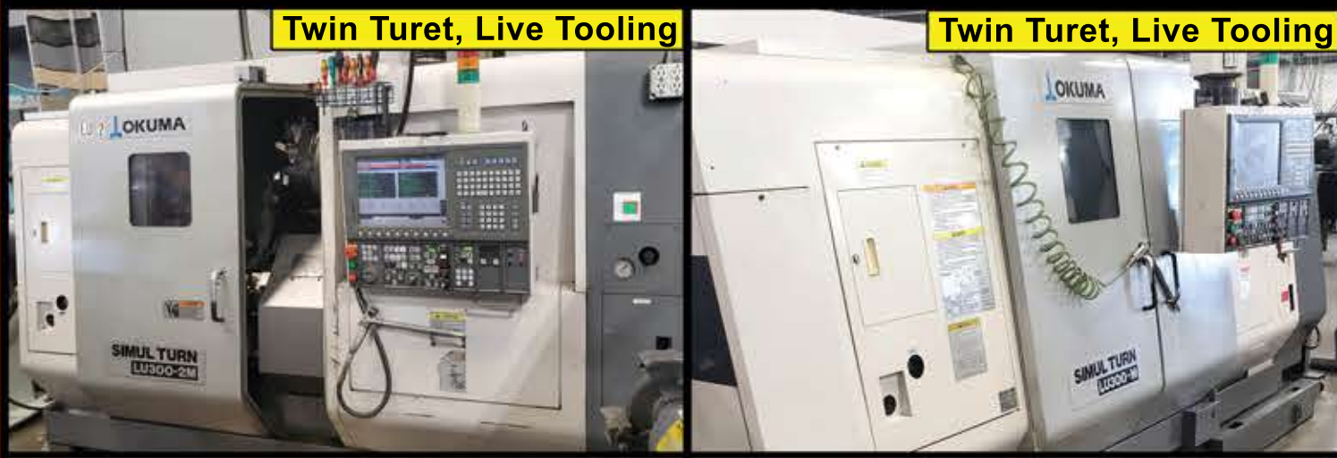
2011 Okuma LU300-2M CNC Lathe