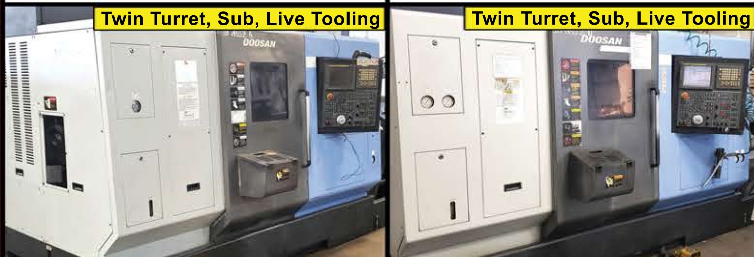
2007 Doosan Puma TT 1800SY CNC Lathe