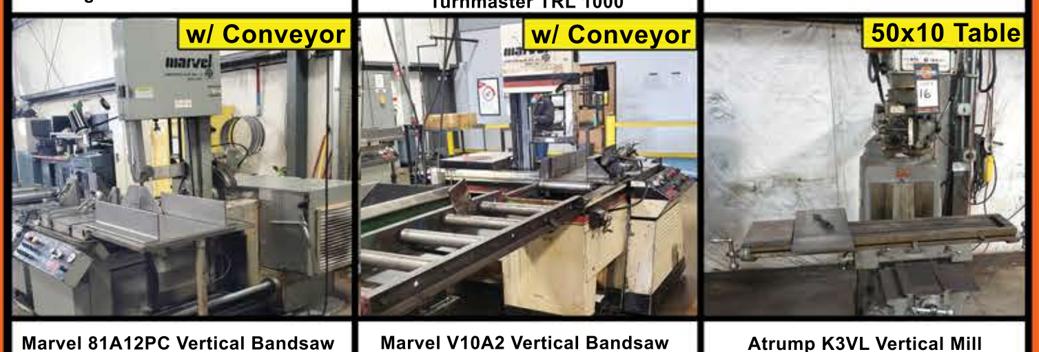
Marvel 81A12PC Vertical Bandsaw