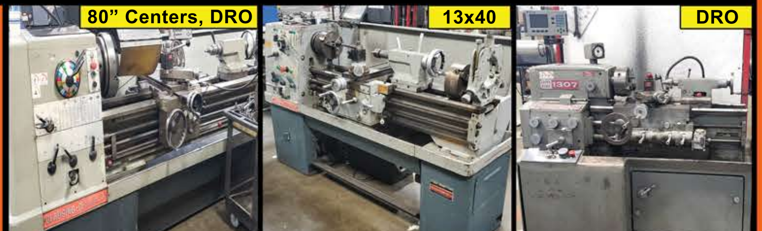
Clausing-Colchester 17 Manual Lathe