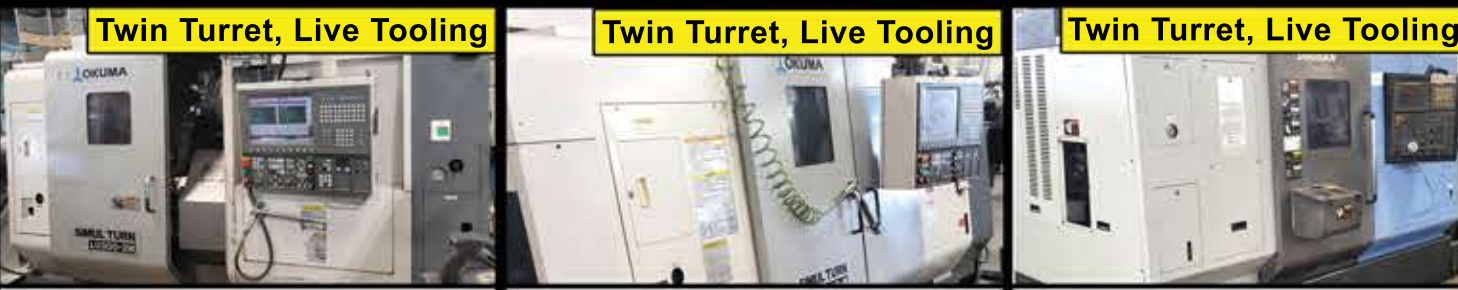
2011 Okuma LU300-2M