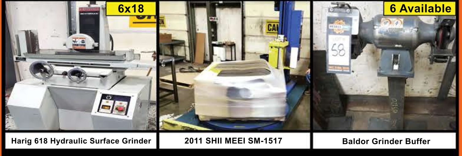
Harig 618 Hydraulic Surface Grinder